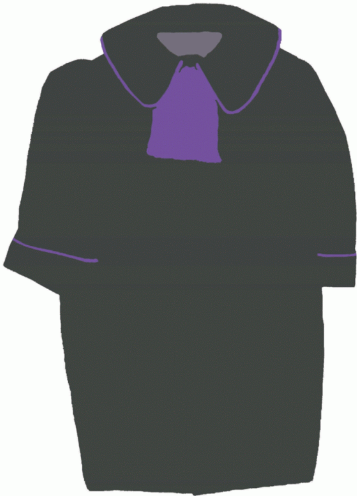
widok z przodu